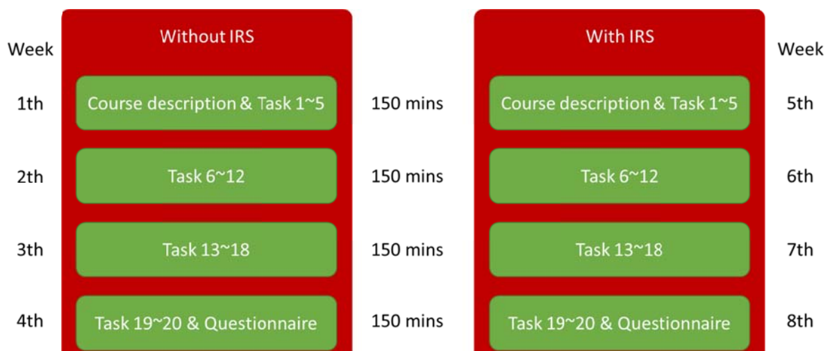
Fig. 3. The Procedures of this study

The learning activity progress took a total of 8 weeks, including two stages as shown in Fig. 3.